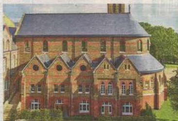
The chapel in the St Joseph's Gate development in Mill Hill, north London, is on sale for £6 million with Knight Frank