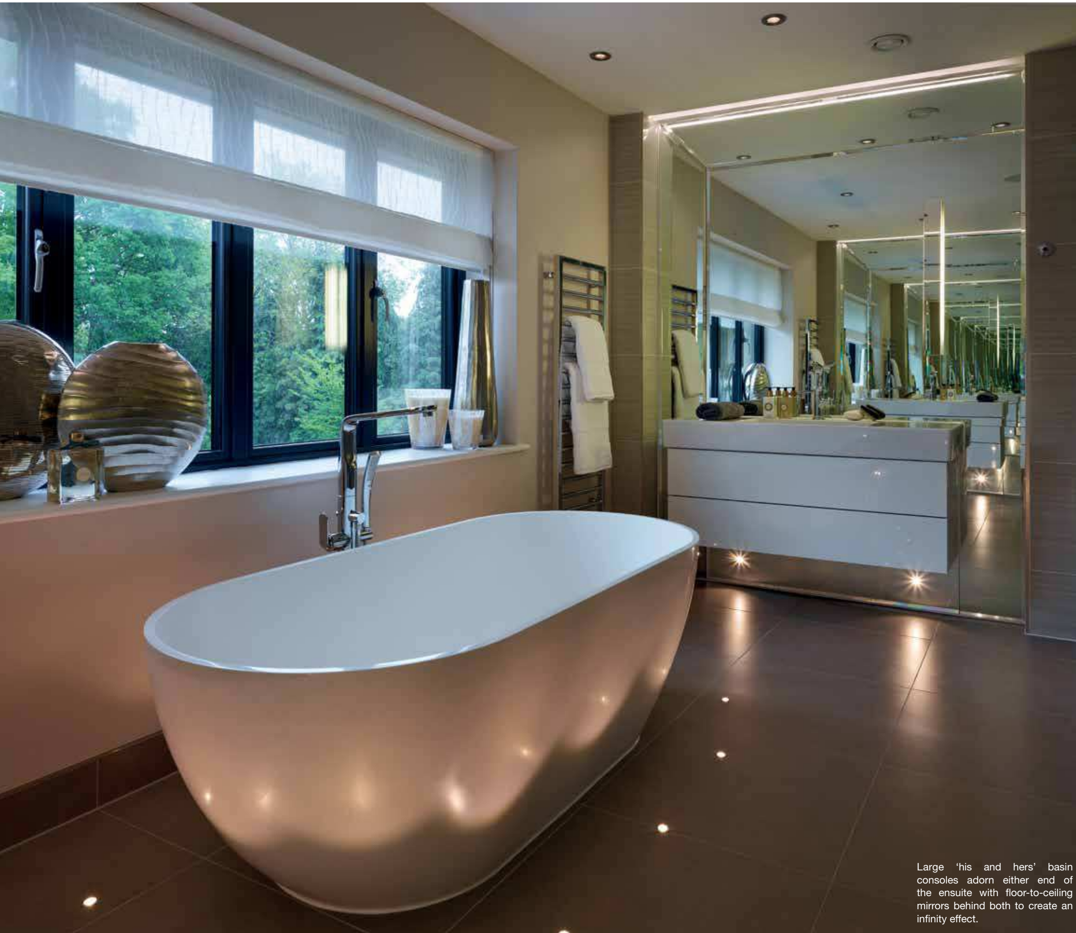
Large 'his and hers' basin consoles adorn either end of the ensuite with floor-to-ceiling mirrors behind both to create an infinity effect.