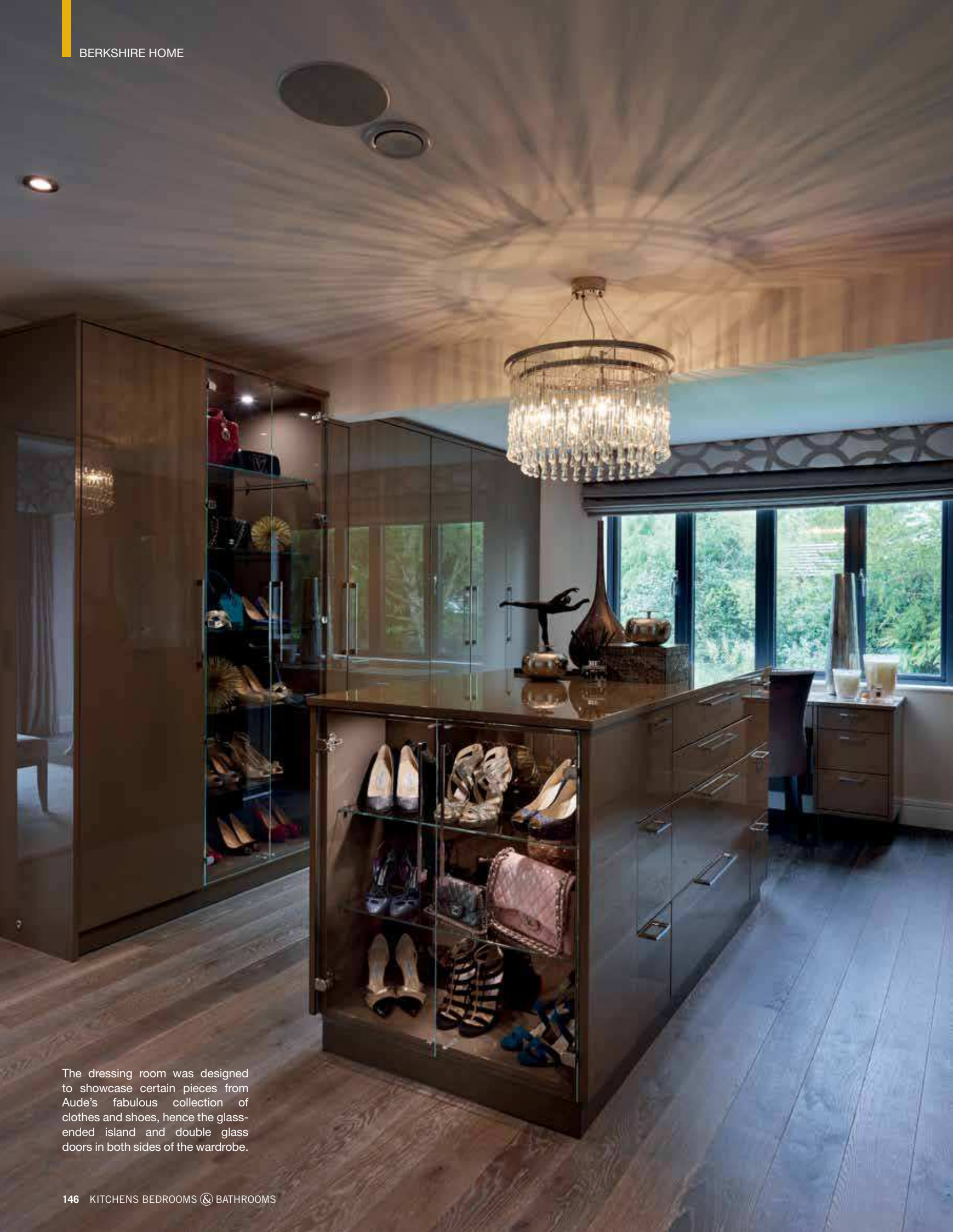
The dressing room was designed to showcase certain pieces from Aude's fabulous collection of clothes and shoes, hence the glass-ened island and double glass doors in both sides of the wardrobe.