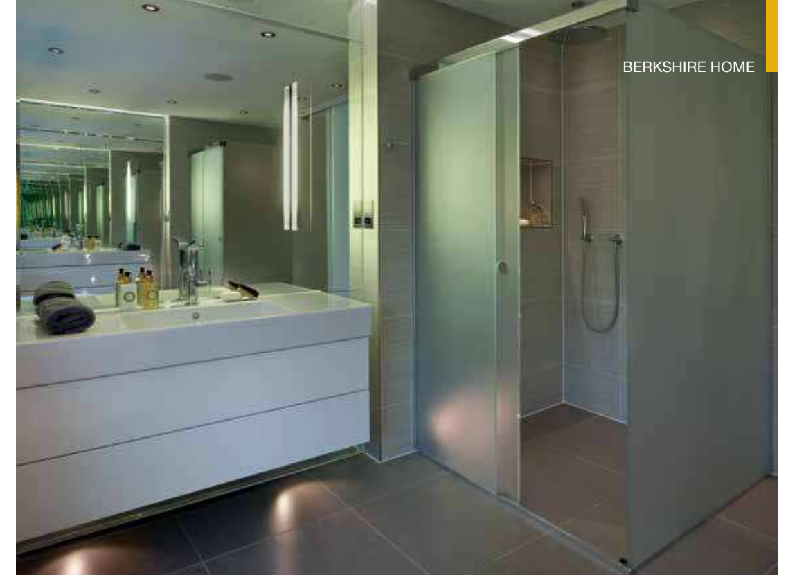
Above: The shower and WC are both concealed behind frosted glass panels to ensure the focus remains on the elegant freestanding bath and views across the treetops.